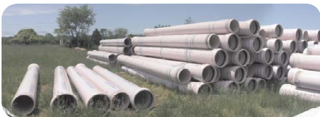
Above: Loudoun County, VA – Color coded and labeled reclaimed water distribution piping